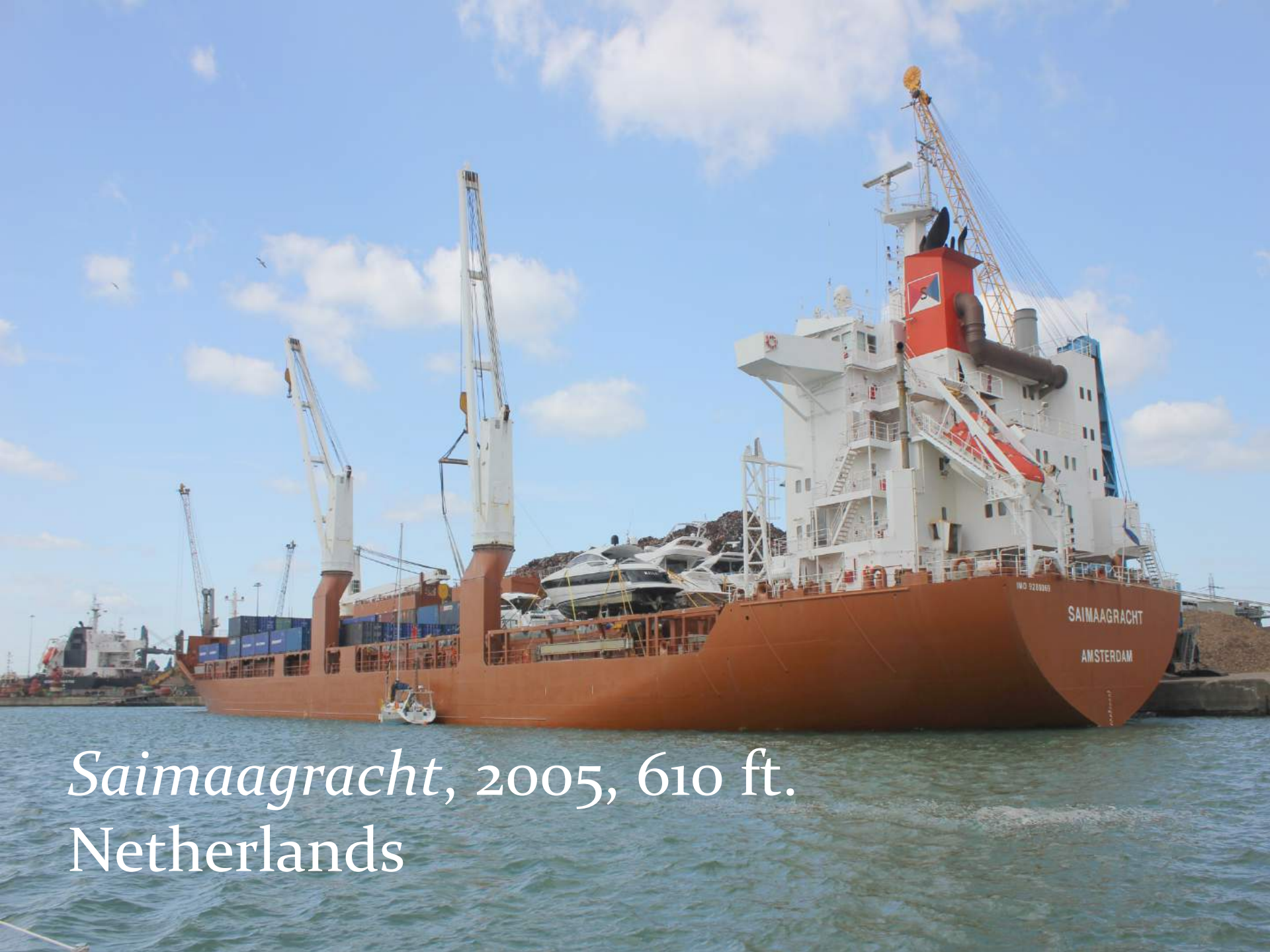
Saimaagracht, 2005, 610 ft. Netherlands